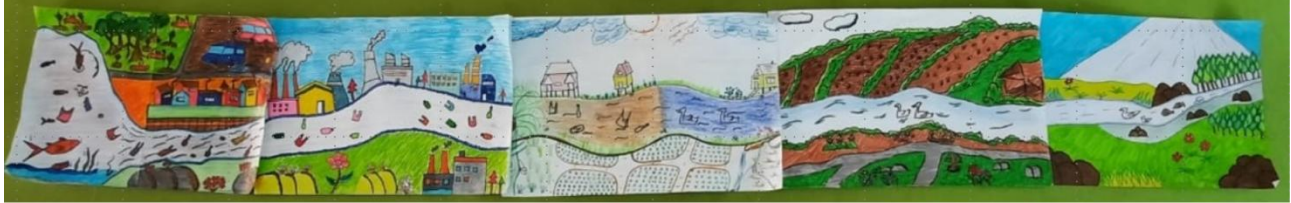
Fig. 5. Students' drawings analyze the condition of the upstream, middle and downstream of a river

Incorporating elements of both PBL and PjBL can effectively provide students with a more engaging and meaningful learning experience (Wiek et al., 2014). As in this case, the teachers are trained using PBL and PjBL approaches, they are more likely to engage in the learning process. Therefore, the environmental problems can be solved by developing textbooks which are relevant to their lives and interests. Besides, teachers can create projects that are relevant and meaningful and require students to apply their knowledge and skills in real-world contexts. As environmental problems are complex, both approaches used in this research project can help them develop important communication and collaboration skills (Farrow et al., 2022; Indriyani Rachman et al., 2021; Sukackè et al., 2022).