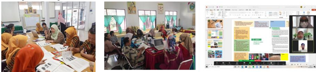
Fig. 3. Textbook writing activities

out at the Graha Kirana Building, one of the NGOs that participated in the book-making project. During the book-making process, the teacher creates an initial draft that includes an introduction, an explanation of the theme, the use of media, assignments, and evaluations.