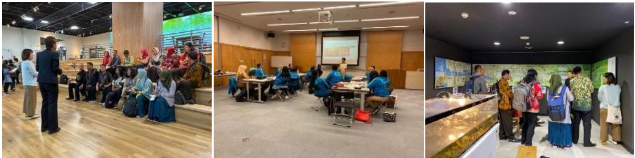
Figure 2. Environmental Leader (EL) workshops for teachers in Kitakyushu Japan

household (16 times), trash can (12 times). From the results, it can be concluded that the environmental problems faced by the community are related to household waste being disposed of in random places along the Deli River. From the interviews with EL teachers who attended the EE training in Kitakyushu, they all reported gaining new knowledge related to environmental learning, getting new ideas, and being inspired. Some argue that the success of Kitakyushu City as an environmentally friendly city is due to the power of education in schools and communities. A visit to Kitakyushu City opened new ideas, broadened teachers' insights when writing books, and made them more communicative, including using learning media. The visit to Kitakyushu City aimed to learn how the city provides EE lessons to students and the public. Fig. 2 shows the EL workshop for teachers in Kitakyushu, Japan.