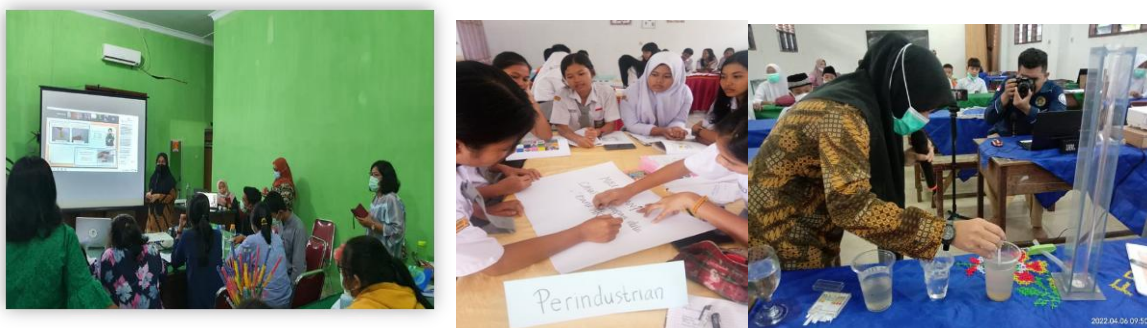
Figure 4. Trial of EE Book

Since the beginning of the project, the EL teacher and the Kitakyushu City team have developed a plan to create an EL book. They started by conducting an opinion poll to identify environmental problems in the Deli River and then developed a theme to be included in the textbook that aligned with the elementary, middle, and high school curriculum and EE subject matter. However, due to the pandemic, the meetings for making the textbook were held online. They have been holding weekly meetings to continue creating teaching materials, and the textbooks are expected to be finished in March 2021, followed by testing at the beginning of April. The questionnaire results show that ELs have gained an understanding of how to create textbooks, teach EE, and feel capable of being agents of change. After the completion of the student books and teacher guidebooks, questionnaires were distributed to teachers to evaluate their experience in creating the books.