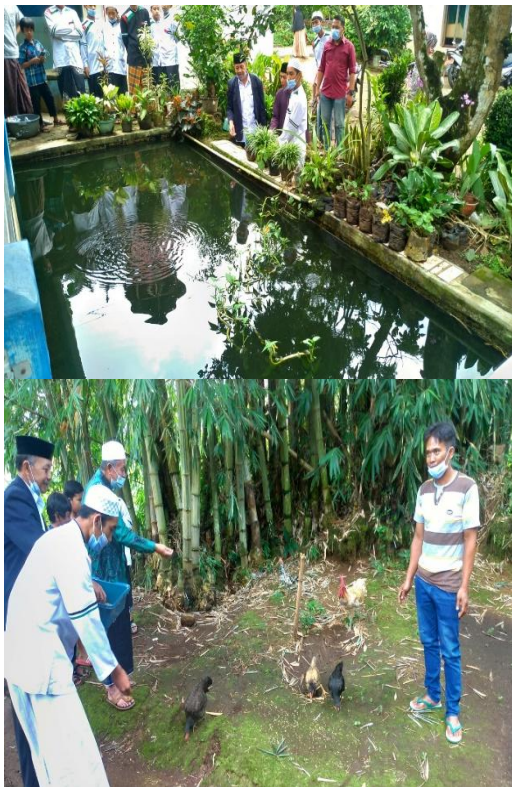
Figure 4. Practice of utilizing Maggot BSF for livestock and fisheries