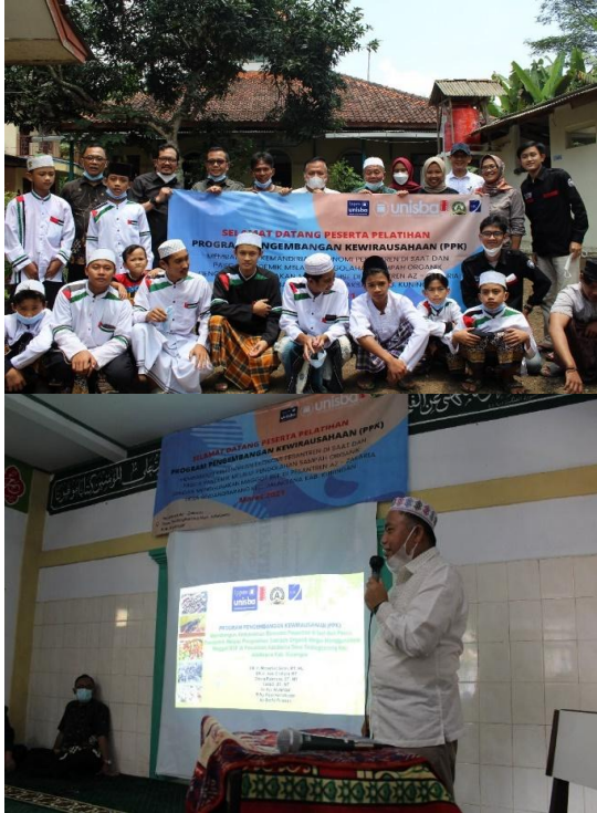
Figure 3. Providing material by service team