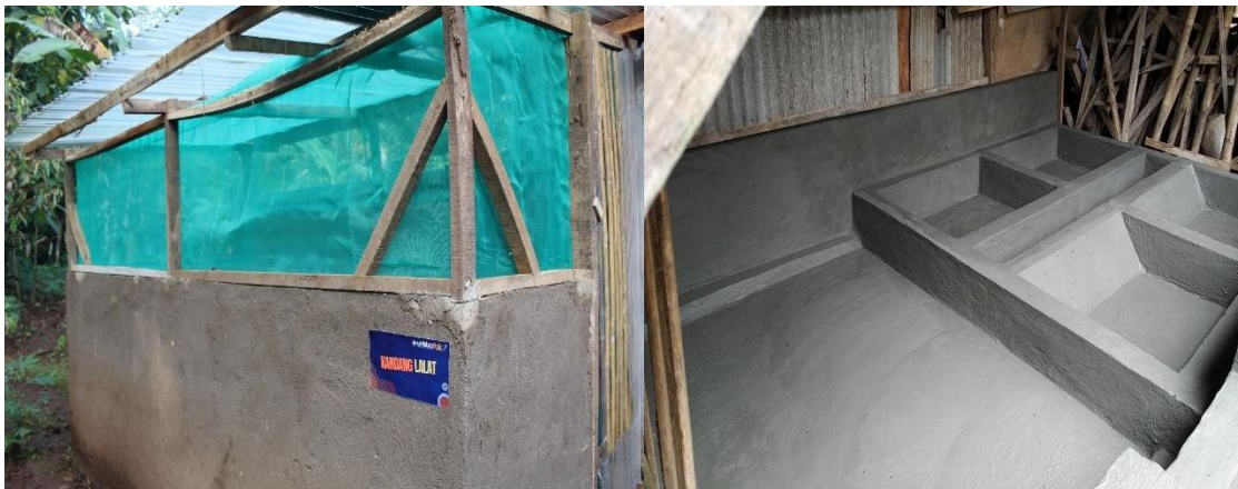
Figure 2. Building Maggot BSF House

construction), entrepreneurial debriefing, and utilization of compost and maggots for agriculture and fisheries. This training is followed by students and the surrounding community with learning by doing methods.