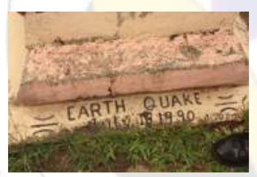
Plate 8. An improvised signage written in concrete plaster commemorating the exact time and date the earthquake occurred.