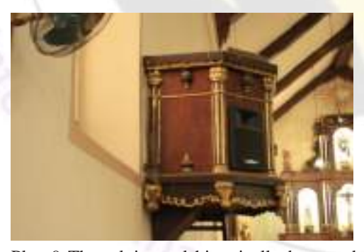
Plate 9. The pulpit panel, historically destroyed by the introduction of an electronic speaker in recent renovation works.