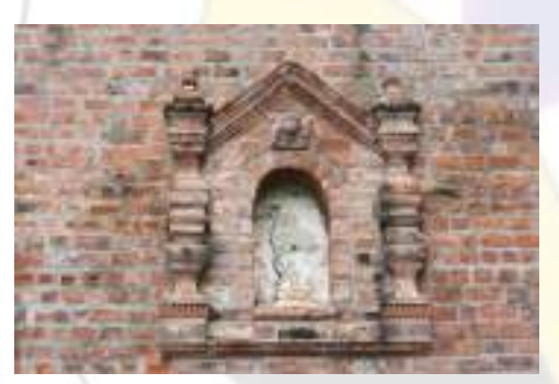
Plate 2. Detail of the belltower façade. The century old original image of the patron saint inside the arch was allegedly stolen.