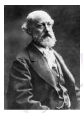
Plate 20. Eugene Emmanuel Viollet-le-Duc, a French Gothic Revival architect, restorer of French medieval buildings, and writer whose theories of rational architectural design linked the revivalism of the Romantic period to 20th-century Functionalism.