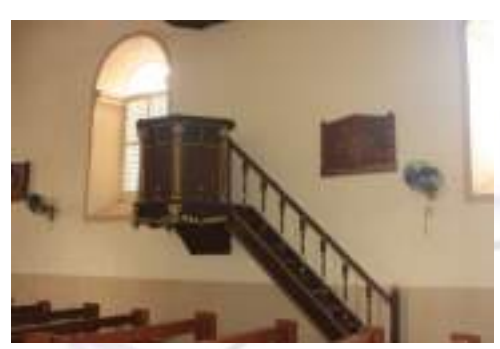
Plate 8. The elevated pulpit ( pulpito ) as seen from the altar. Originally, it was used by the priests before to deliver their sermon to the congregation.