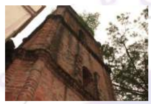
Plate 1. The four-tiered belltower as photographed from the ground with a tree and its roots clinging to the crevices of the brickwork.