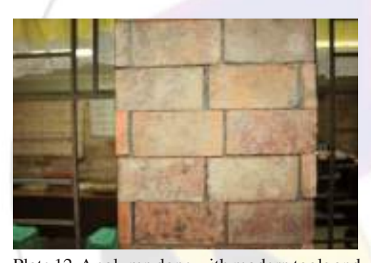
Plate 12. A column done with modern tools and procedures using the same brick as the chief material but mixed with concrete rather than stucco plaster. Resembles a modern decorative stone effect rather than reconstructing the original.