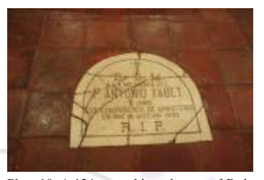
Plate 10. A 124-year old tombstone of Padre Antonio Xabet near the altar.