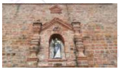
Plate 3. The newly installed image of Saint Vincent de Ferrer.