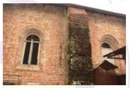
Plate 5. Dilapidated windows and a support buttress invaded by grass, moss and algae.