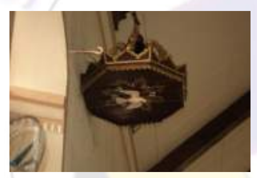
Plate 9. The detail of the pulpit's overhead cover. Paint is obviously peeling off and needs to be restored.