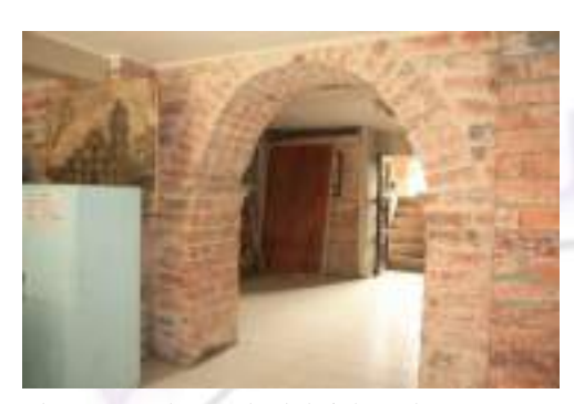
Plate 11. The arched brickwork entrance's keystone had been covered by the recent addition of ceiling. The original clay fired floor tiles have been replaced by modern ceramic tiles.