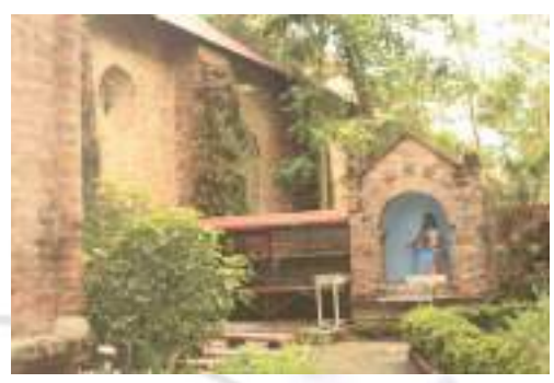
Plate 4. Support buttresses on the right side of the church where grass, algae and moss thrive on its outer face. Also shown is the area for grotto and candle lighting area for parishioners.