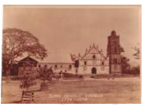
Plate 18. Saint Vincent de Ferrer Church photographed in 1954.