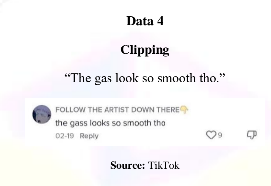
Figure. 6 Example of Clipping

In data 3, the function of the use of slang words is emotive feeling. Slang is a critical tool for language change and revitalization, and its brightness and color bring vitality to ordinary communication since it is a way to express excitement, passion, and wrath. The user comments on the posted video and expresses his dissatisfaction with the content. This language elicits a wide range of emotions in people. When group members use the slang word "bffr" it conveys skepticism about a scenario or remark.