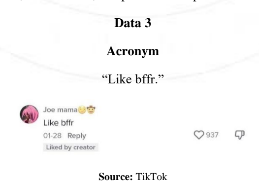
Figure. 5 Example of Acronym

The function of using a slang word in data 2 is emotive feeling. The user commented on the posted video to express something as being of low intensity, restrained, or not highly noticeable. It can be used to downplay or minimize the significance of something. Overall, "lowkey" is often used to express a more subdued, subtle, or understated approach or feeling towards something, contrasting with a more overt or exaggerated style. Furthermore, modern language is heavily impacted by popular culture, social media, and personal interpretation.