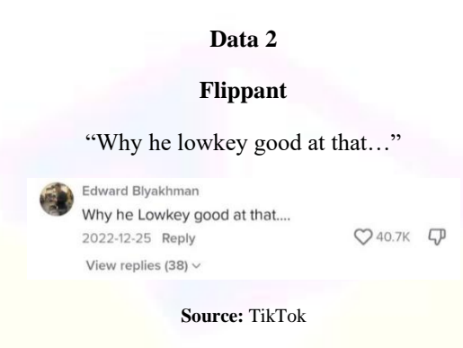
Figure. 4 Example of Flippant

The function of utilizing slang phrases in data 1 is to establish self-identity. In response to the behaviours revealed in the video upload, a commentator wishes to note, "They are planning to bring this up at Congress." What distinguishes these expressions is that they imply an informal relationship between friends, which brings the conversation closer and makes the other person feel more relaxed and like a member of the group.