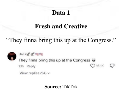
Figure. 3 Example of Fresh and Creative

The figure above showed data found by the researcher in order to give some illustrations to the readers.