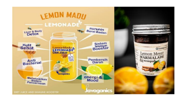
Figure 2 Javaganics Mitra Partner Products