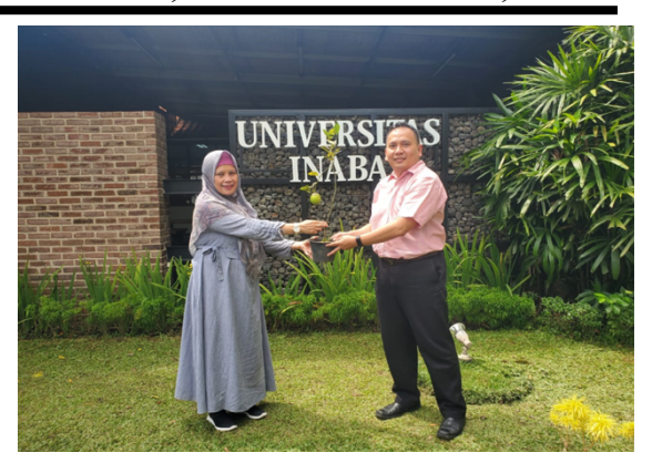
Figure 6 Handover of Lemon Seeds with INABA University