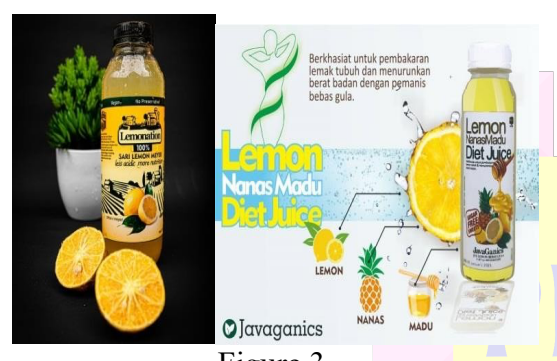
Figure 3 Javaganics Mitra Partner Products

b. Partner's priority problem is that they have not implemented digital marketing and digital-based social media management and Ads. Not yet registered in Market Place (Tokopedia)