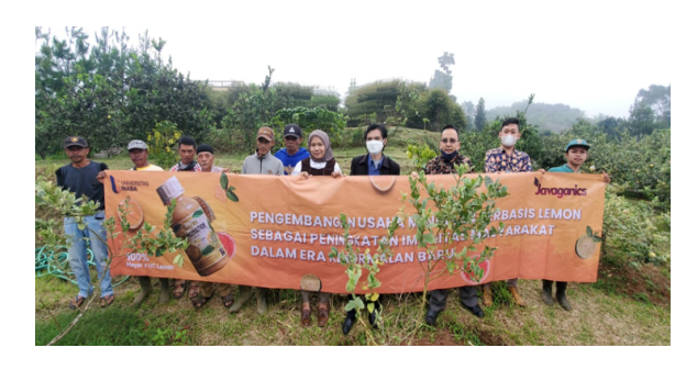
Figure 5 Photo with INABA University Lecturers with Business Owners and Lemon Farmers