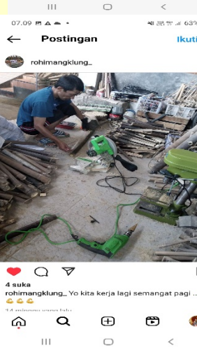
Figure. 3 Rohim Angklung Social Media