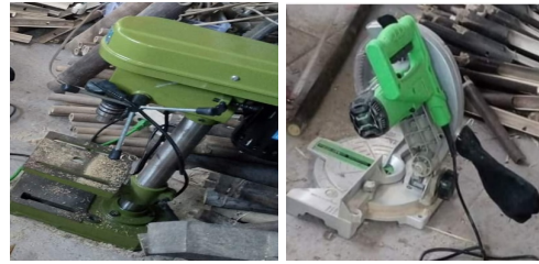
Figure .1. Drilling machine and Circular Cutting Machine

Based on information from business actors, the drilling machines and circular cutting machines they own are old, so this affects the quality of the products produced. Apart from that, if there are many orders, it will affect the quantity produced. So this will affect the speed of work. So far, the product produced in one day is only 3 sets of large angklung per week per person. However, for small or medium angklungs, you can get 1 to 2 angklungs a day. Depends on the type of angklung you order.