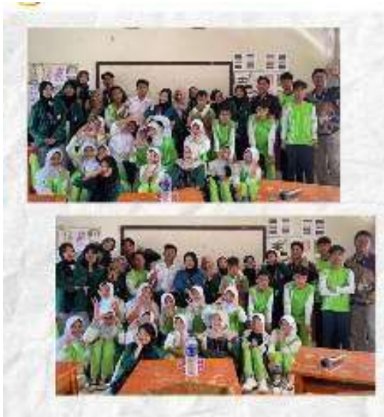
Figure 1. 2 Group photo of students of SMPN SATAP 9 Pesawaran