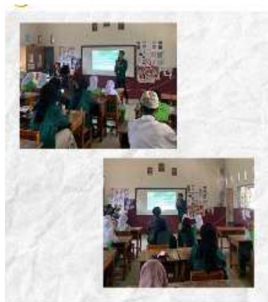
Figure 1.1 Photo of teaching and learning activities