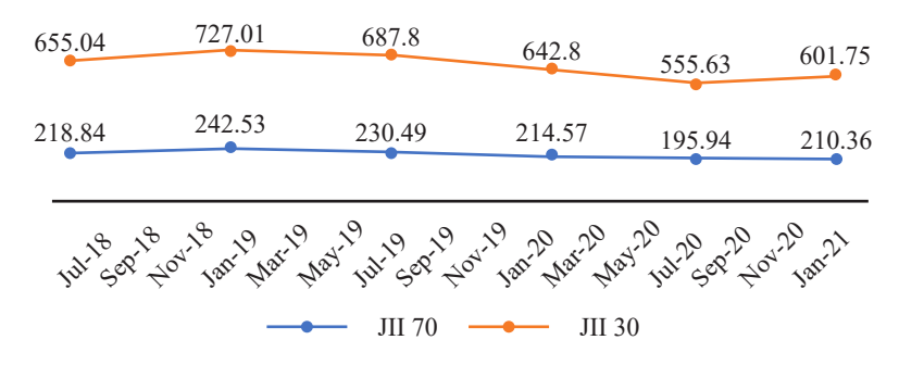
Figure 1. Jakarta Islamic Index Stock Price

The development of the sharia stock index is reflected in the value of the JII and JII70 stock indexes as follows: