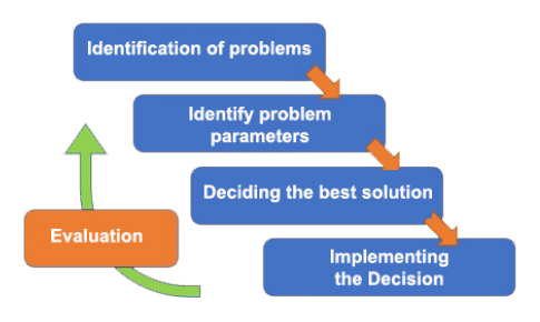
Figure 2.1 Steps to make decisions

These steps begin with the identification and formulation of the problem, after the identification of problem followed the by the identification of the problem parameters, followed by finding the best alternative that will carry out the decisions that have been taken. In implementing the decision, an evaluation will be carried out to find out whether the results are accordance with what is expected.