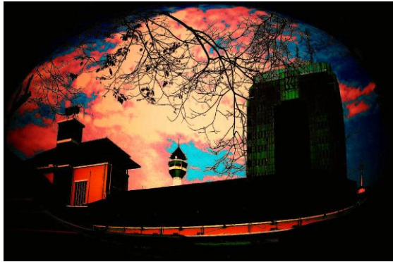
Artwork by Heriwanto, "Imagine" 2007

Apart from that, there are two approaches in aesthetics. First approach; want to directly examine beauty in beautiful objects or nature as well as art itself or want more. Second approach; highlighting the situation of contemplation of the beautiful feeling that is being experienced or the experience of beauty within the person. Aesthetic experience is closely related to feelings. An art photo is said to have aesthetics, the characteristics of which are that the photo is not only able to exploit beauty but is also able to contribute universal humanist values to mankind.