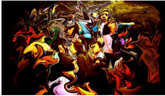
Artwork by Heriwanto, "Bermain" 2008

Among these processes are the processes of empirical observation, comparison, reflection and experience. So, these processes are expected to produce a photographic work that can attract attention. Quoting Andreas Feininger's opinion by B. Darmawan in Indonesian Photo Magazine edition 5, that a photo is considered good if it contains three factors: Interesting (eye-catching); Contains (it has content) and; Eternal (it last). Therefore, these three factors must be present in every fine art photography that the photographer or artist will make. In fact, the photo must be able to become the work of a master of photography and a role model for photographers and others.