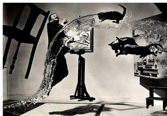
Artwork by Philippe Halsman "Dali Atomicus" 1948

Some of Philippe Halsman's concepts appear to be successful in dialogue with the people he photographs, such as when photographing characters such as Albert Einstein or Salvador Dali. The following are several concepts and photo shoots created by Philippe Halsman.