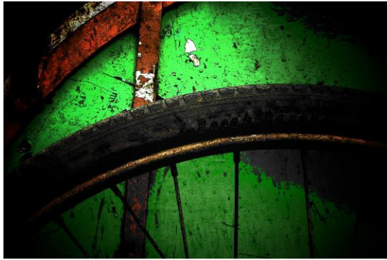
Artwork by Heriwanto, "Becak Tua" 2007

Basically, it is easy to make any number of photos as long as you still have the photo negative, but in fine art photography, the process cannot be the same as other photo works and must go through stages and processes. The large variety of works of art over time has brought new changes and innovations to the world of fine art. There have been many ideas, imaginative ideas and creativity that have been produced by great artists, including through monumental new works of art that are known to this day. So that the results of these works of art can become inspiration and imagination for other artists in the world to produce other works of art. As is the case with fine art photography.