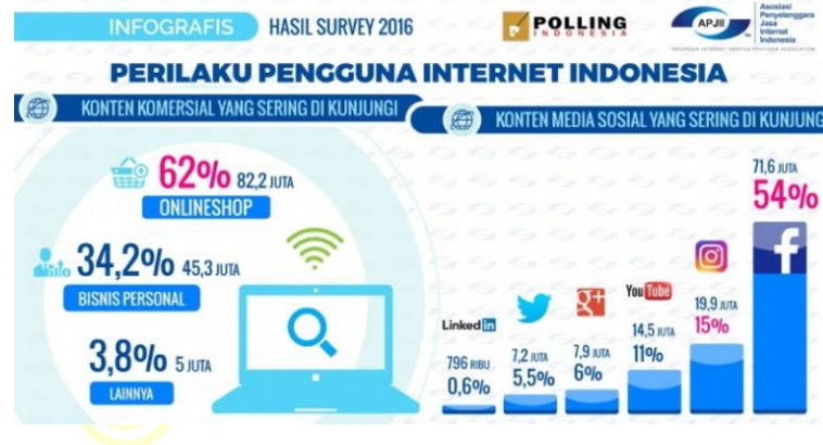
Figure 2. Indonesian Internet User Behavior in 2016

spend at least once a month. Based on data released by the TNS Indonesia E-Commerce Survey in 2014, it appears that online shopping behavior of internet users in Indonesia is very compatible with the characteristics of handmade products because 78% of items purchased are fashion (eg clothing, bags, shoes, accessories and others).