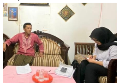
Figure 3. Informant 03 LK

LK also felt the same way that this farming income could be an additional cost in meeting daily needs, " Wow, I don't think so, but I don't know " ( Informant 03 LK). LK even did not feel that farming income could be used for daily needs.