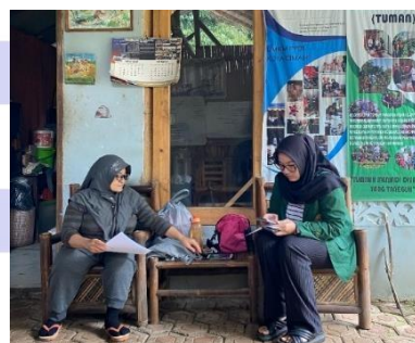
Figure 2. Informant 03 HS

Next, informant HS also gave a similar statement, "Not all of the agricultural produce, at most for additional cultivation" (Informant 02 HS) .