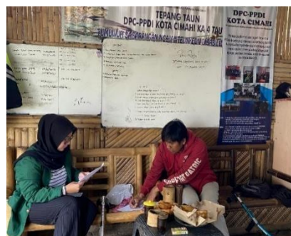
Figure 1. informant 01 PD

(TUMAN) farmer group, all three felt capable of meeting their daily needs, although in meeting them they did not use all the proceeds from the sale of agricultural products, PD explained that "Not enough but enough to add to food" (Informant 01 PD).