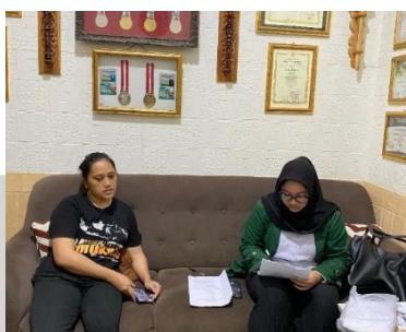
Figure 4. Informant 04 EA

This was validated by informant EA as part of the DPC-PPDI of Cimahi City who said that productive sources were already accessible, but he expressed his doubts about human resources "Regarding human resources, maybe the membership in Tuman. Alhamdulillah, until now there are those who are consistent in Tuman. But, it is very true that the involvement of Tuman members is slowly decreasing day by day, yes" (Information 04 EA).