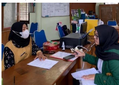
Figure 5. Informant 05 N

As for the response from N as part from the Food and Agriculture Service of Cimahi City , who also conveyed similar things that source Power man Not yet become easy thing reachable , as he said " Its members That it seems like not enough But a number of consistent " ( Informant 05 N).