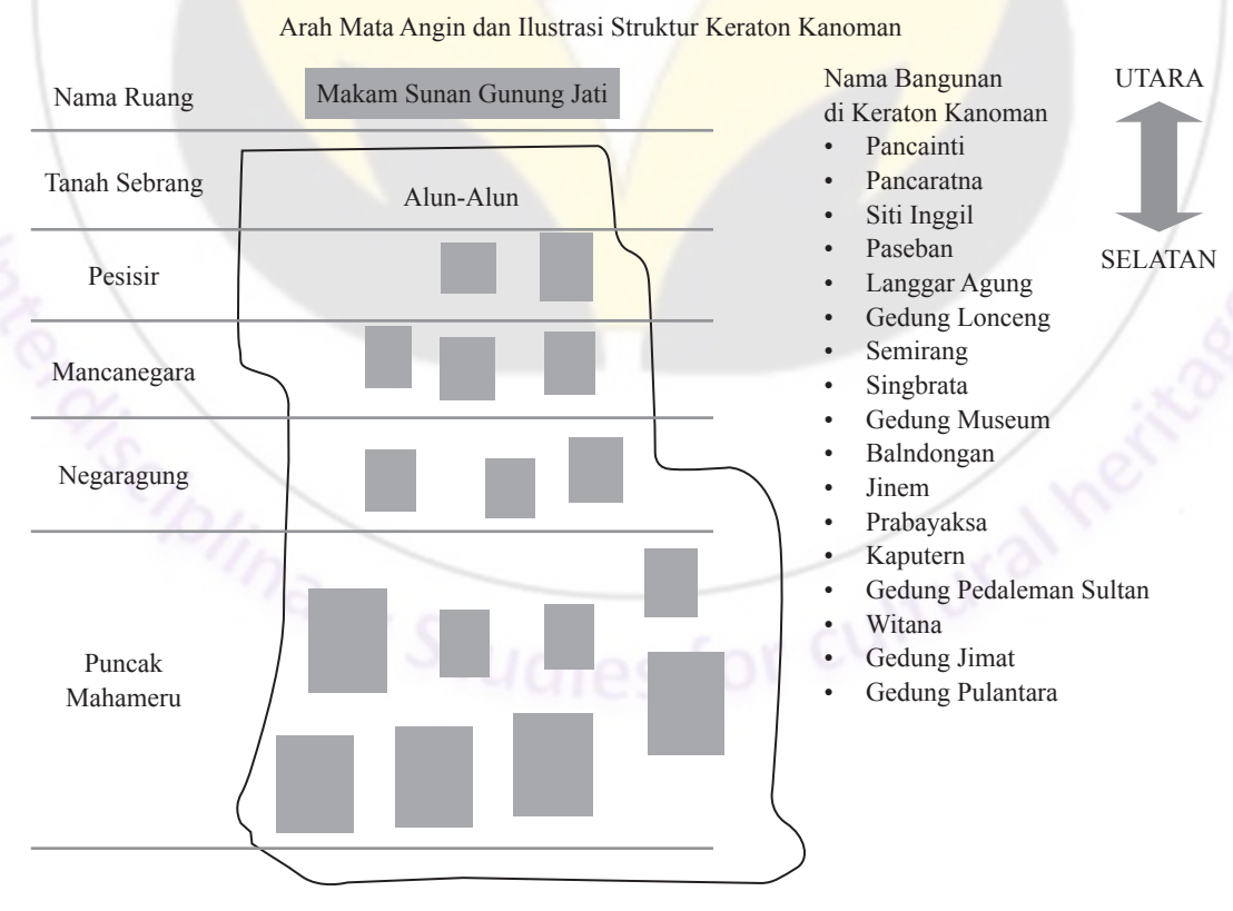
Figure 2. The concept of Space Structure of the Kanoman Palace